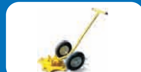
EZ Mover (500023)