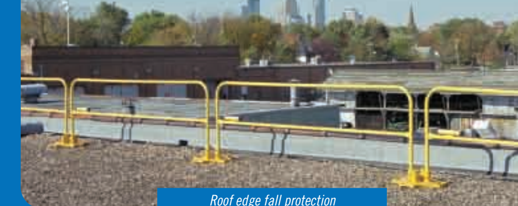
Roof edge fall protection