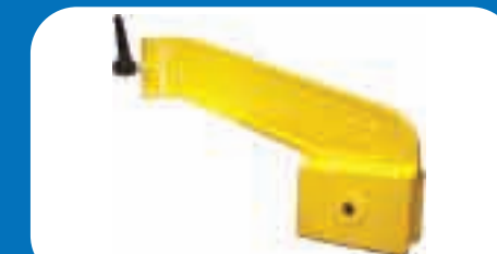
Toe Board Bracket (300025)