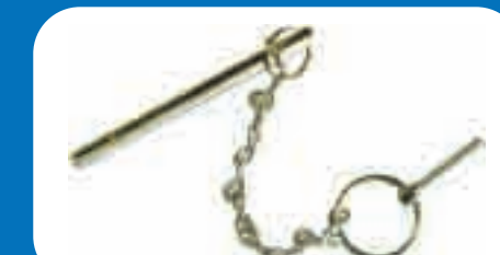
Securing Pin (100016)