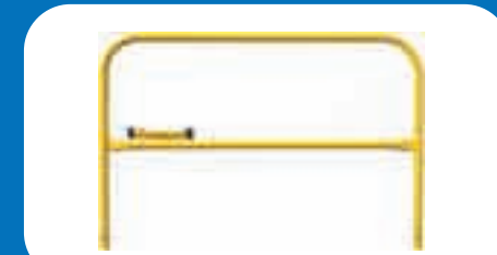
Rail: 3 ft (500105), 3 1/2 ft (500106), 4 ft (500104), 5 ft (500001), 7.5 ft (500004), 10 ft (500005)