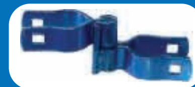
Our 90 deg. welded hinge. Allows the gate to only open away from the hatch.

In most situations, OSHA (Std. 29 CFR 1910.23) requires guardrail protection on the exposed sides of openings in roofs and floors. BlueWater Mfg. has modified our SafetyRail 2000 guardrail system to meet those safety concerns. Our Roof Hatch/Skylight Systems exceeds OSHA Std. 29 CFR 1910.23 and 1910.27. It is the only product available in the market with a gate assembly that meets the same OSHA regulations and REQUIRES NO DRILLING INTO ANY SURFACE for installation. The Roof Hatch/Skylight Systems set up in minutes and are easily dismantled for roof repair.