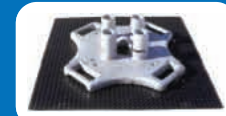
Galv. Base (300037) and EPDM Roof Pad (100034)