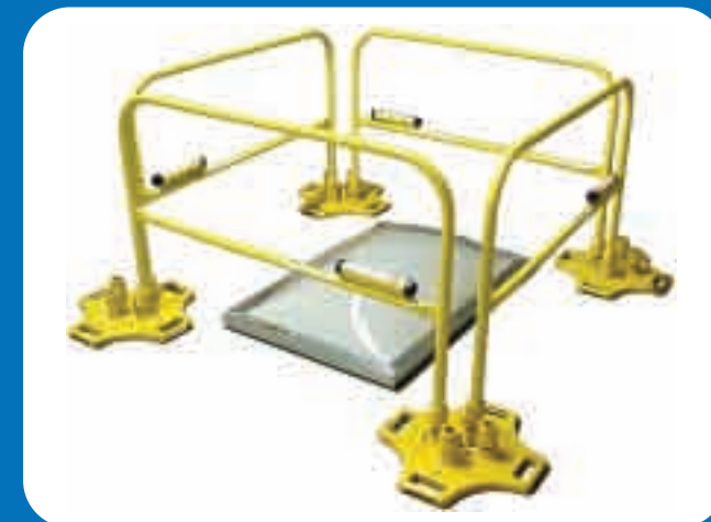
Skylight System protecting a 3' X 4' skylight.

SCUTTLE/ROOF HATCH KITS: (Includes: 1 Sized Gate, 2 Sized Rail Sections, 4 Bases and 6 Locking Pins) Note: On Side Exit Hatches: 4th Rail and 2 ea. pins are included.