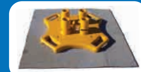
Std Base (300014) and BUR Roof Pad (100029)

Please inquire about various size gate kits, galvanized base kits and optional galvanized rail sections.