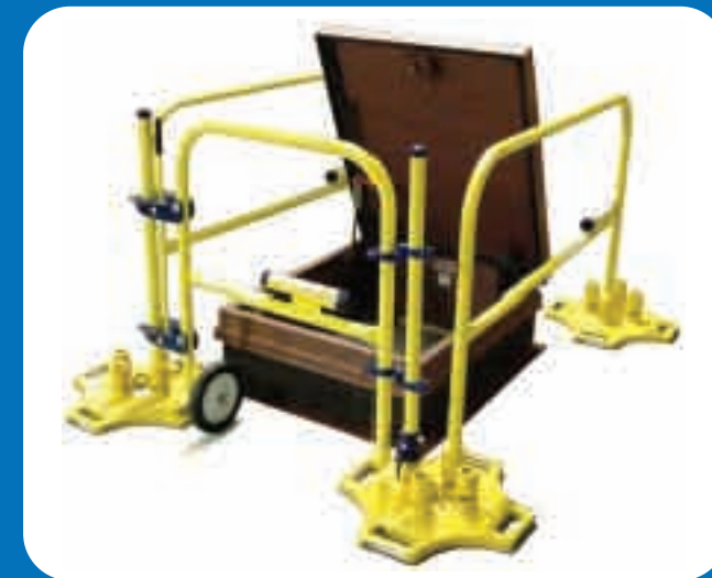
Roof Hatch System with OSHA compliant gate.

In most situations, OSHA (Std. 29 CFR 1910.23) requires guardrail protection on the exposed sides of openings in roofs and floors. BlueWater Mfg. has modified our SafetyRail 2000 guardrail system to meet those safety concerns. Our Roof Hatch/Skylight Systems exceeds OSHA Std. 29 CFR 1910.23 and 1910.27. It is the only product available in the market with a gate assembly that meets the same OSHA regulations and REQUIRES NO DRILLING INTO ANY SURFACE for installation. The Roof Hatch/Skylight Systems set up in minutes and are easily dismantled for roof repair.