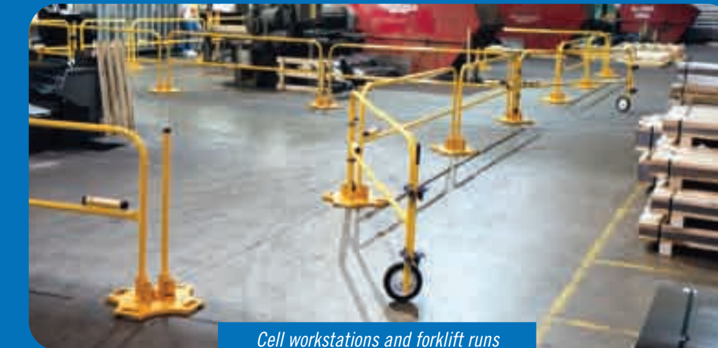
Cell workstations and forklift runs