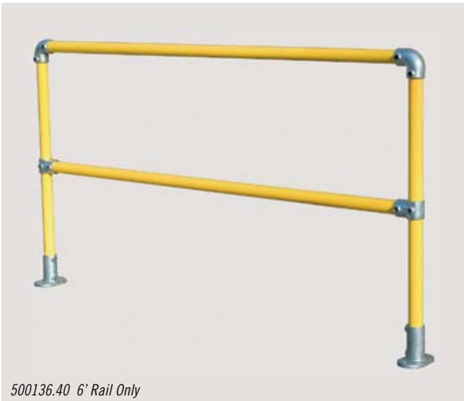
500136.40 6' Rail Only

The Kwik-Rail Safety Railing is an economically priced handrail system that is easily assembled with just a hex key. Create a tough and durable barrier in just minutes with no welding. The cross members come standard in 6' lengths that give you a lower cost per foot. If 6' is too long for your needs, simply cut the cross members to size. The railing is 42" tall. The systems come in kit form and custom gates can be manufactured. The kits can be secured by off-the-shelf anchoring bolts. Please inquire with BlueWater Mfg. about our full range of structural pipe fittings.