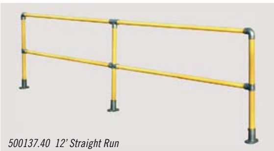
500137.40 12' Straight Run