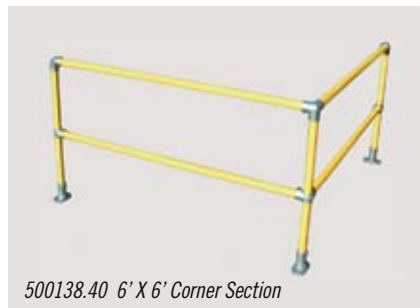
500138.40 6' X 6' Corner Section